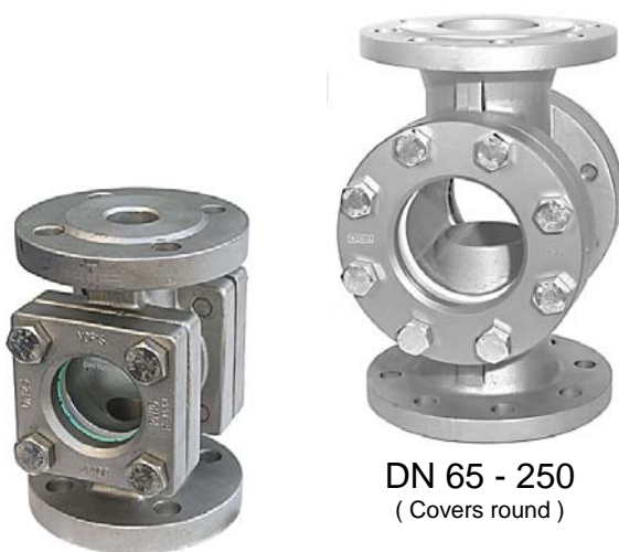
DN 15 - 50 ( Covers square )